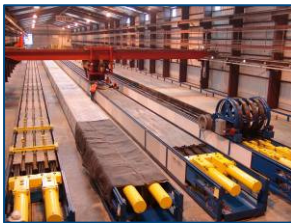
Long line lay-out