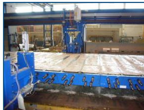
Pre-stressing and releasing